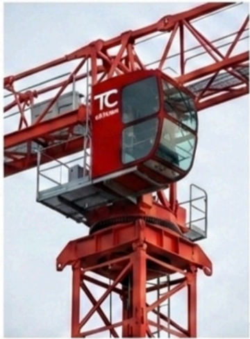
Силата на червеното. Най-сигурният път към върха